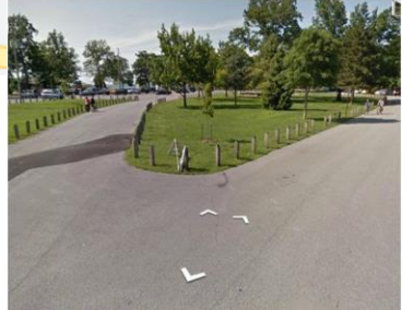
Start/Finish by No Parking sign on left.

Start at Lakewood Park -Right on Lake -Right on Abbieshire -Left on Edgewater -Turnaround at Lakeland -Right on Rosalie -Left on Lake -Left on Nicholson -Left on Edgewater -Left on Parkside -Right on Lake -Follow Lake back to Lakewood Park -Right into Lakewood Park Finish at Lakewood Park